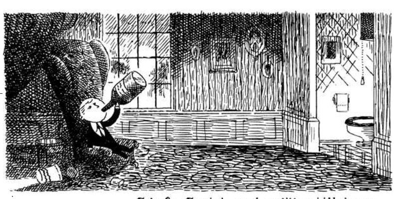
S is for Scotch, and swilling till dawn. T is for Throwing it up later on.

Still running - deadline Monday night - is our Haiku-to-Mars contest. See bit.ly/invite1023.